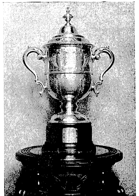
THE BEDFORD ATLANTIC COAST CHAMPIONSHIP TROPHY