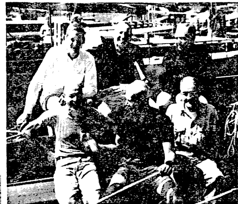
Lady Linden Crew—R. Y. C.