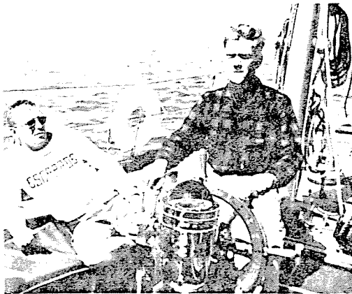
Escapade—Detroit Y. C.